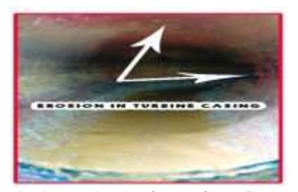
Fig.4: Erosion in the Turbine Casing

Casing [11] may be said to an enclosing shell, tube, or surrounding material. Due to improper flow of water in venturimeter as well as through valve and due to surface roughness, there is a development of the scales on the surface of the interior parts of the turbine causes the irregular flow of water inside the casing which causes leakages in casing [4] and hence reduces the efficiency of the turbine.