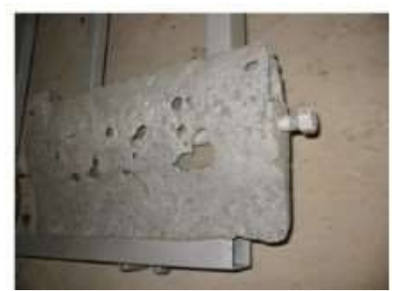
Fig.5: Erosion in the gate

Hydraulic turbine blades are essential part of large hydropower equipment's. Accurate[6] measurement of the blade has crucial impact on the overall operational efficiency and services. Vane blades get damaged due to continuous striking of high pressurised water. This high pressure of water cannot be known with accuracy because of improper working of various parts of turbine. Hydrodynamic load on blades developed unwanted stress which results blades gets damaged.